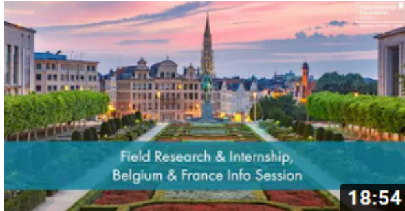
UCEAP Field Research & Internship Info Session

This document is an advising tool written by a Berkeley Study Abroad (BSA) Adviser to review program specific details that may impact a student's decision to apply for a UCEAP program. The document is not a summary of eligibility requirements, academic, housing, application and other logistical details freely available to students on the UCEAP and BSA website. If any concerns you have are not addressed on the UCEAP website or the Advising Notes document, please contact the BSA Adviser for this program.