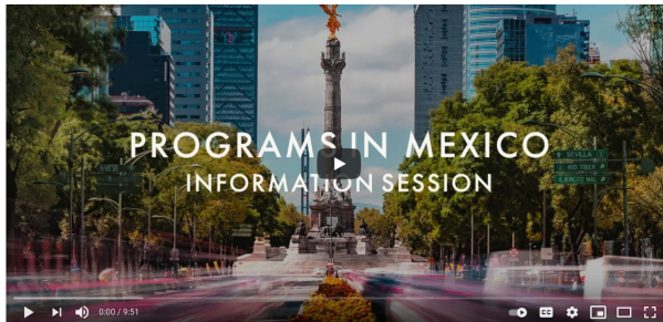
Programs in Mexico Info Session

This document is an advising tool written by a Berkeley Study Abroad (BSA) Adviser to review program-specific details that may impact a student's decision to apply for a UCEAP program. The document is not a summary of eligibility requirements, academic, housing, application, and other logistical details freely available to students on the UCEAP and BSA website. If any concerns you have are not addressed on the UCEAP website or the Advising Notes document, please contact the BSA Adviser for this program.